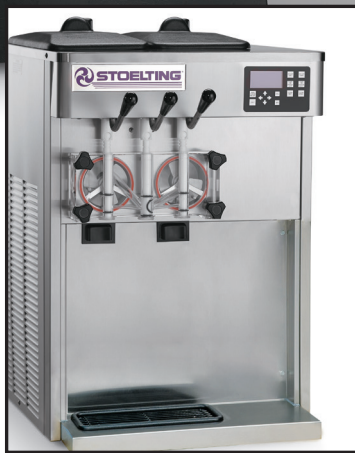
Modified Design for Frozen Yogurt Installations